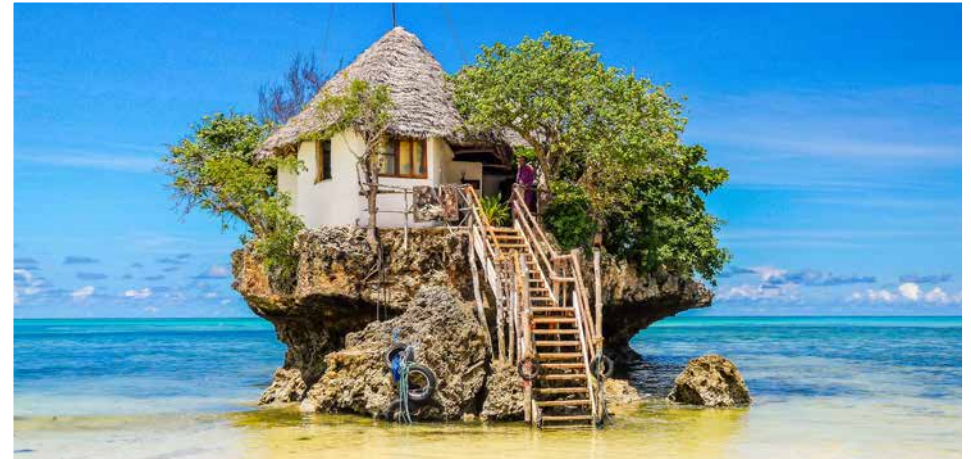
THE ROCK RESTAURANT