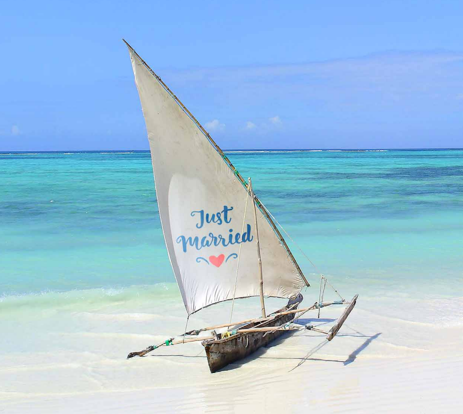
Experience the magic of Zanzibar