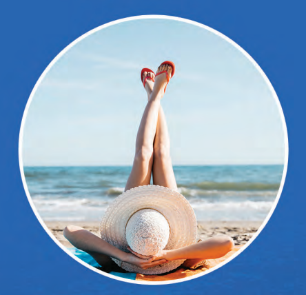
Relax on the beach. Spend your precious time together in a tropical beach on the sand, sun & water