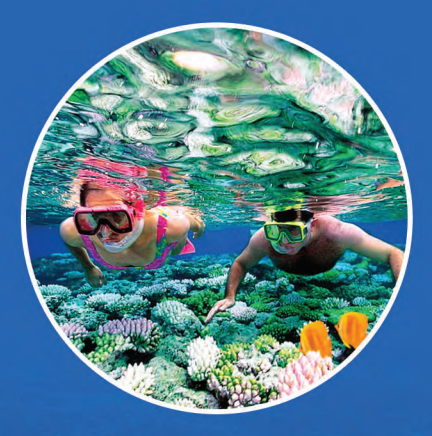
Smell the sea and feel the sky let your soul and sprit fly. Capture the delightful view of corals and fishes around